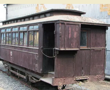
Hanifl-type passenger car