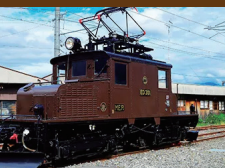
ED301 electric locomotive